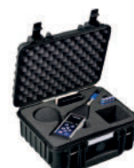
SA 72 Waterproof carrying case