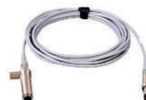
SC 91A Microphone Extension Cable