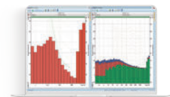
SF 973A_P1 Package 1/1 & 1/3 octave and audio recording