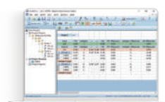
SF 973A_20 STIPA measurement