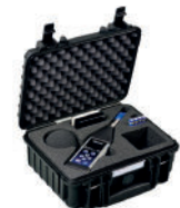
SA 72 Waterproof carrying case