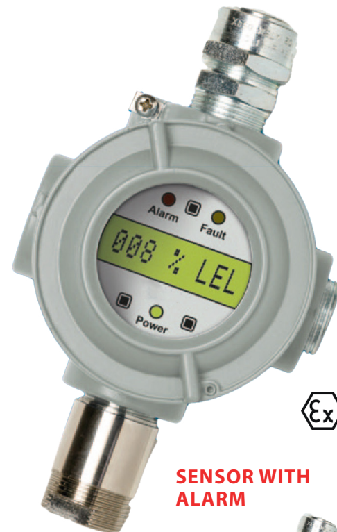
SENSOR WITH ALARM