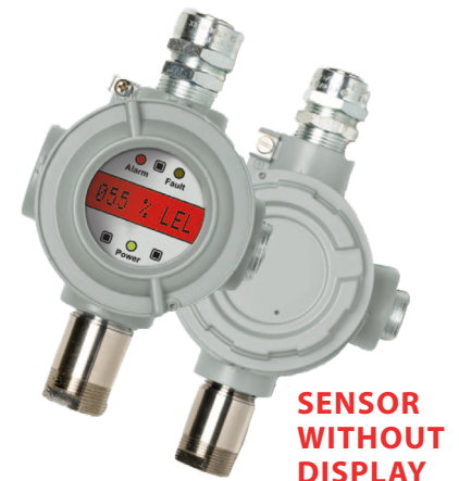
SENSOR WITHOUT DISPLAY