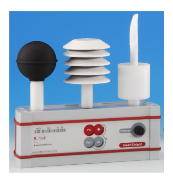
ELR610S: 5 cm diameter black globe sensor satellite modules

The Heat Shield models with radio (ELR610M / ELR615M) can be supplied with additional two wireless satellite modules (ELR610S / ELR615S). The satellite units are used to measure environmental conditions at three positions or levels and calculate Head-Torso-Ankle Weighted Average WBGT. Heat Shield radio can cover up to 300 m in line-of-sight distance, in indoors conditions it may vary.