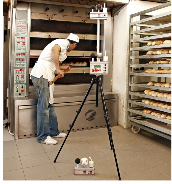
Three levels WBGT on the same vertical