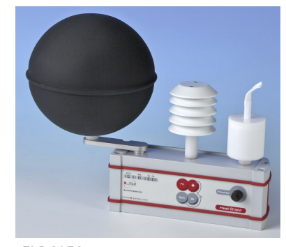
ELR615S: 15 cm diameter black globe sensor satellite modules