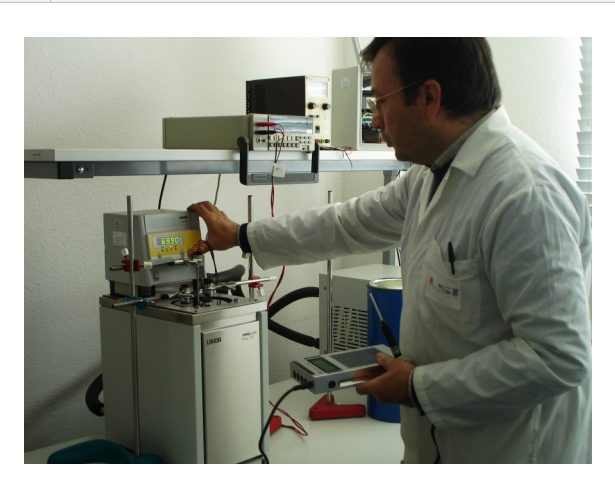
LSI LASTEM is an ISO17025 accredited laboratory for temperature measurements. All sensors manufactured are tested inside our laboratory. LSI LASTEM provides Test report for any sensor and, under request, ISO17025 or ISO9001 calibration certificates (see Accessories list).