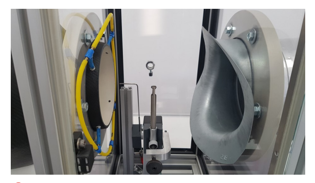
▶ LSI LASTEM is an ISO17025 accredited laboratory for air speed measurements. All sensors manufactured are tested inside this laboratory. LSI LASTEM provides Test report for any sensor supplied and on request, ISO17025 or ISO9001 calibration certificates (see Accessories list).