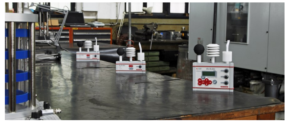
Assesments in three positions of the same environment